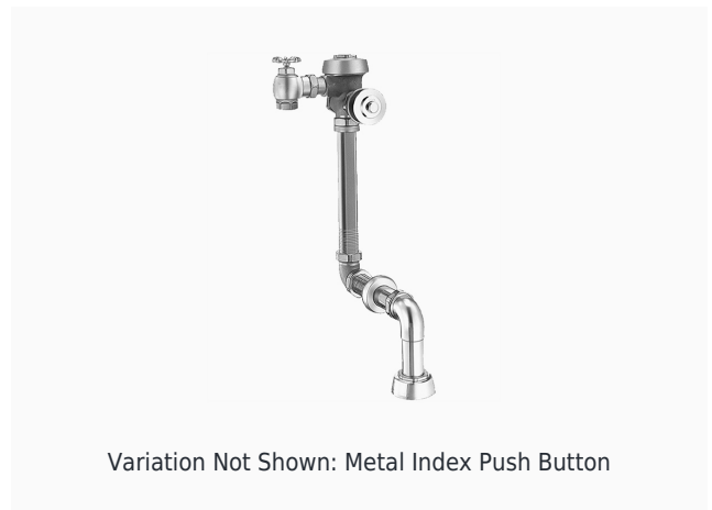
Variation Not Shown: Metal Index Push Button